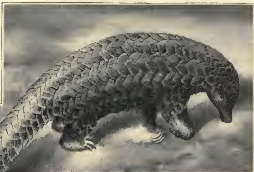
✓ FIG. V. MANIS TETRADACTYLA. ATTADILLO.

Manis longicauda Sundev., K. Sven. Vet.-Akad. Handl. Stockh., 1842, p. 251. Gray, Proc. Zoöl. Soc., 1865, p. 363. Id. Cat. Carniv. Pachyderm.